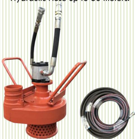
THP-4 15M Hydraulic Hose 3/4"