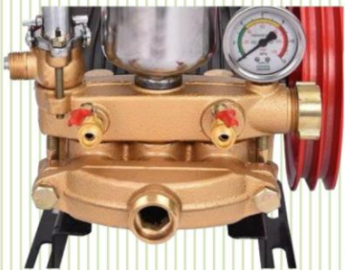
FEATURES: BRASS BALL VALVE - DURABLE AND WATERTIGHT.