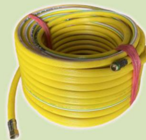
25M Delivery Hose