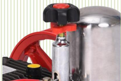
FEATURES: PRESSURE KNOB - EASY TO ADJUST PUMP PRESSURE.