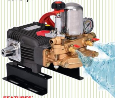
FEATURES: 2 OPERATORS CAN WORK AT THE SAME TIME.