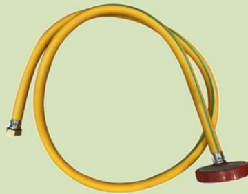
Suction Hose with Foot Valve