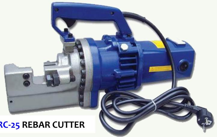
RC-25 REBAR CUTTER