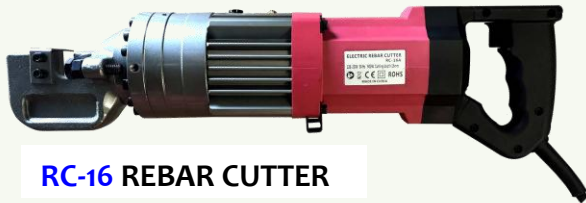
RC-16 REBAR CUTTER