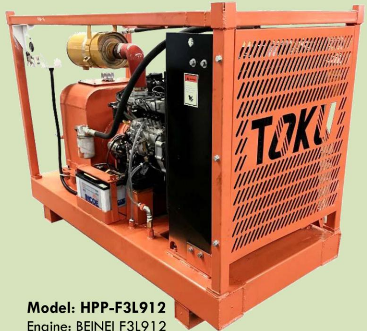
Model: HPP-F3L912 Engine: BEINEI F3L912