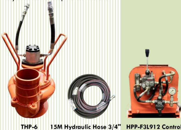
THP-6 15M Hydraulic Hose 3/4" HPP-F3L912 Control