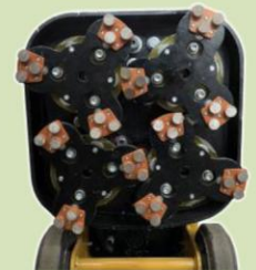
4 x Magnetic Pad Holder