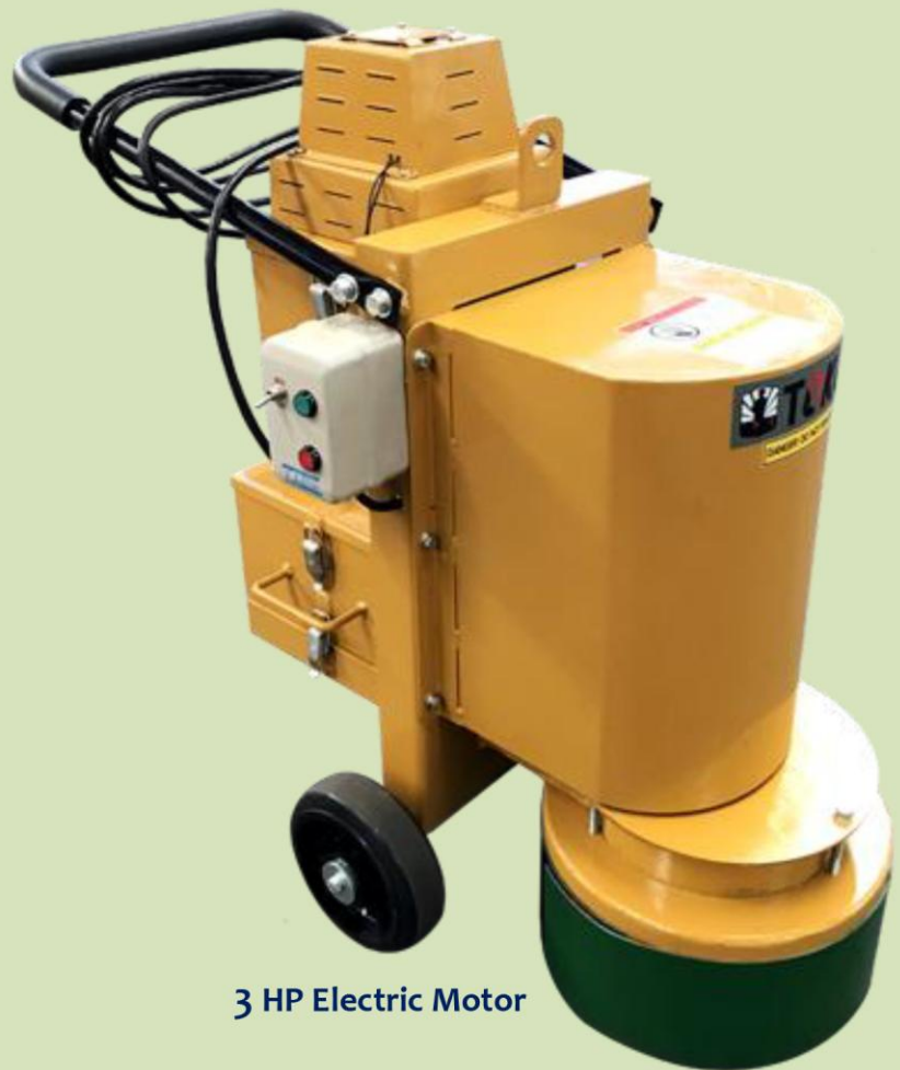
3 HP Electric Motor