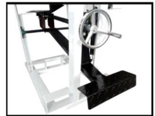
Rise-Decline feeding Hand-Wheel