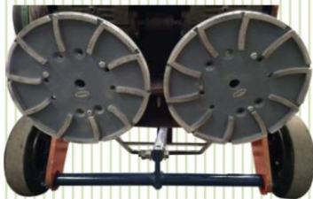
2 x 10" Grinding Disc - For Rough Grinding