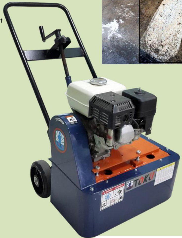
Standard Machine complete with 2pcs 10" Grinding Disc