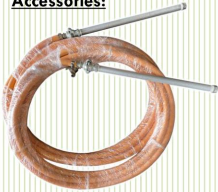
Delivery Hose with Gun