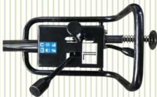
OPERATION LEVER + DEADMAN HANDLE