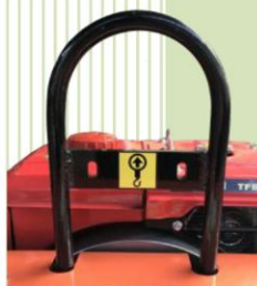
LIFTING HOOK 2