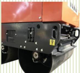
LIFTING HOOK 1