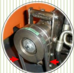
HEAVY DUTY CLUTCH